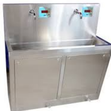
Automatic two bay