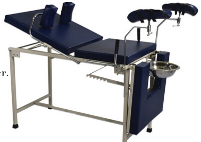
Model No.: SAM-576