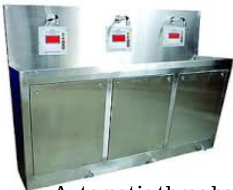
Automatic three bay