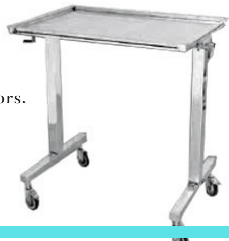
Model No.: SAM-599