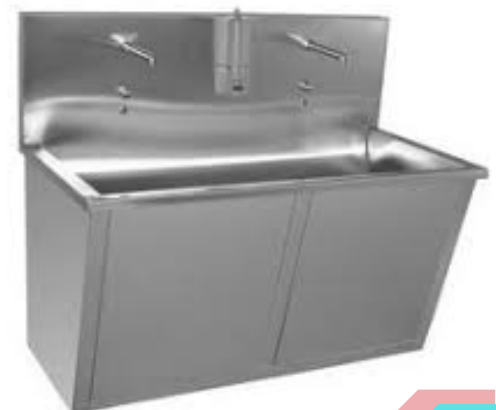
Manual elbow operated two bay