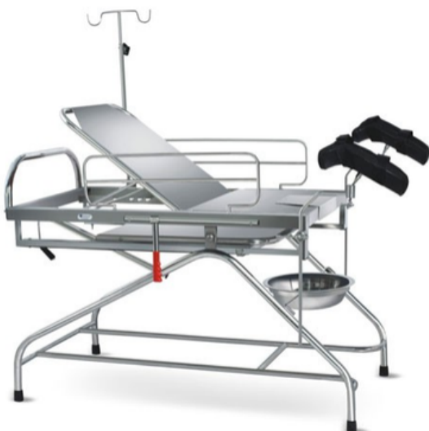
Model No.: SAM-577