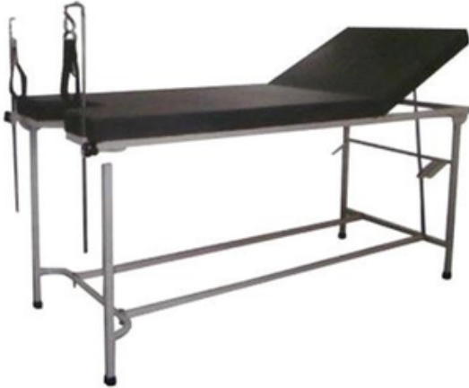
Model No.: SAM-575